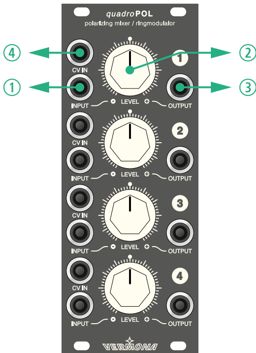
Figure 2: quadroPOL front

quadroPOL offers four identical channels, each with two inputs, one control and one output.